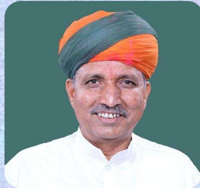
Hon. Shri Arjun Ram Meghwal