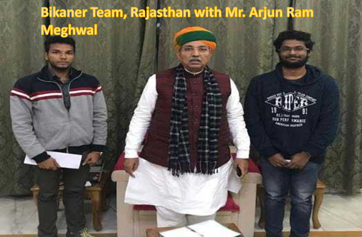
Bikaner Team, Rajasthan with Mr. Arjun Ram Meghwal